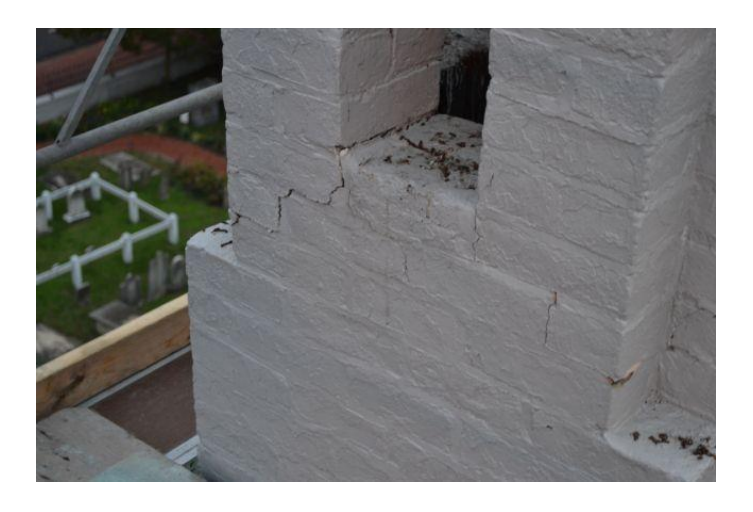
Work on the Chimneys